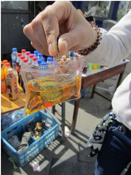
Street vendors in China are selling keychains containing a live turtle, like this.

Laws? What laws? China only has laws that protect wild animals. Since these animals are supposedly not wild there is no law against making these keychains or owning one. Can you say animal abuse?