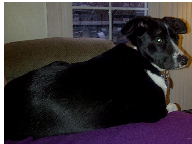
Wendy the border collie / lab mix