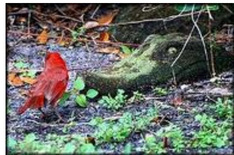
The ornamental alligator before being sprayed with officers bullets. The “alligator” is expected to make a full recovery.