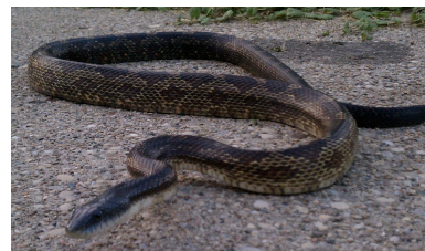
A black rat snake, common to Ohio, that we picked up from a residence in Montgomery and relocated far away.

Oh yuk, a snake! I hope they don't get any bigger than that.