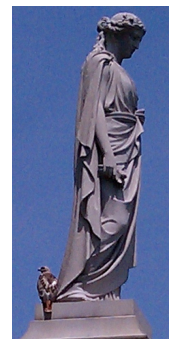
A Red Tailed Hawk perched atop a monument in Spring Grove Cemetery.