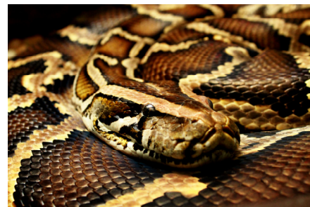
A Burmese Python, like the one above, is thought to be on the loose in Melbourne, FL.

Residents have been advised to keep an eye on their children and small pets. If this is a 14 foot python it could kill a person and potentially eat the family pet.